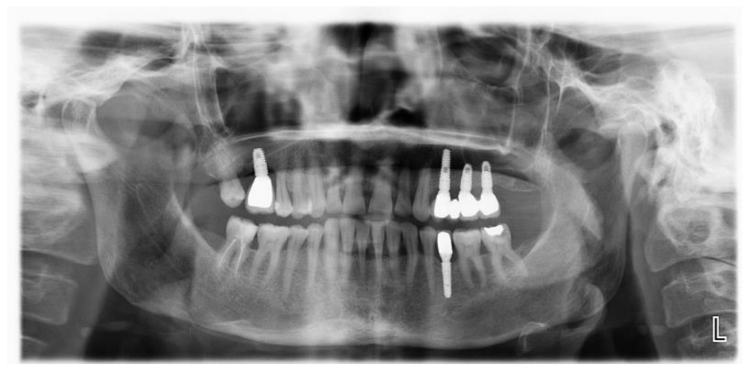
Figure 3. Restoration of the partially edentulous lower and upper jaw bone with dental implant treatment.

Figure 2. Restoration of the lower and upper jaw bone of a total edentulous patient with dental implant treatment.